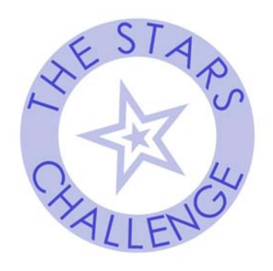
The Stars Challenge