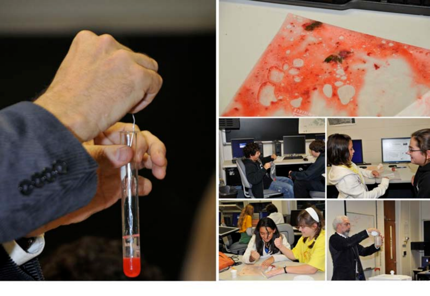
What fun! We didn't make too big of a mess and the strawberries smelled so good.