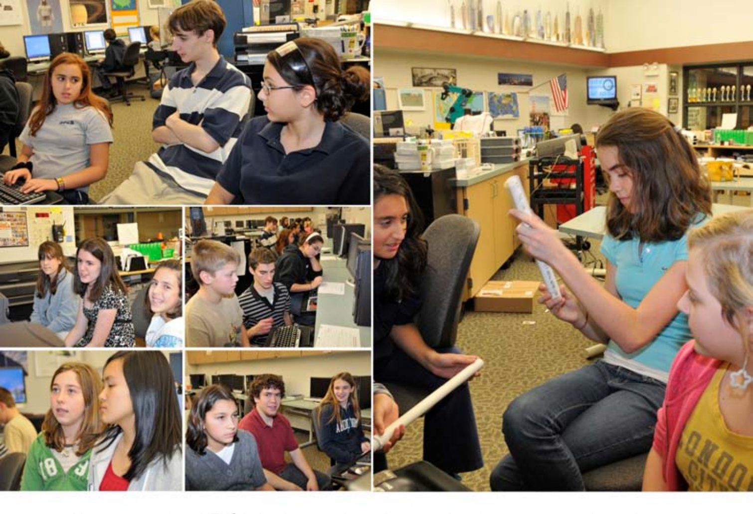
Your mentors from HTHS helped you work out the procedure for your proposed experiment. Hopefully many of you will be joining them at the Jersey Shore Science Fair.