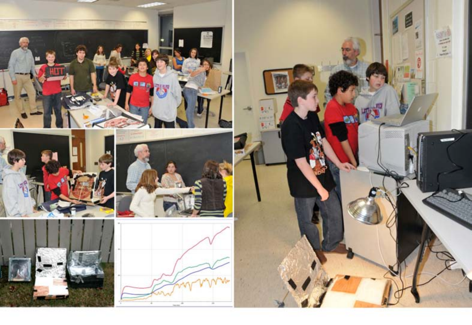
The heliothermal collectors were fun to build and test.