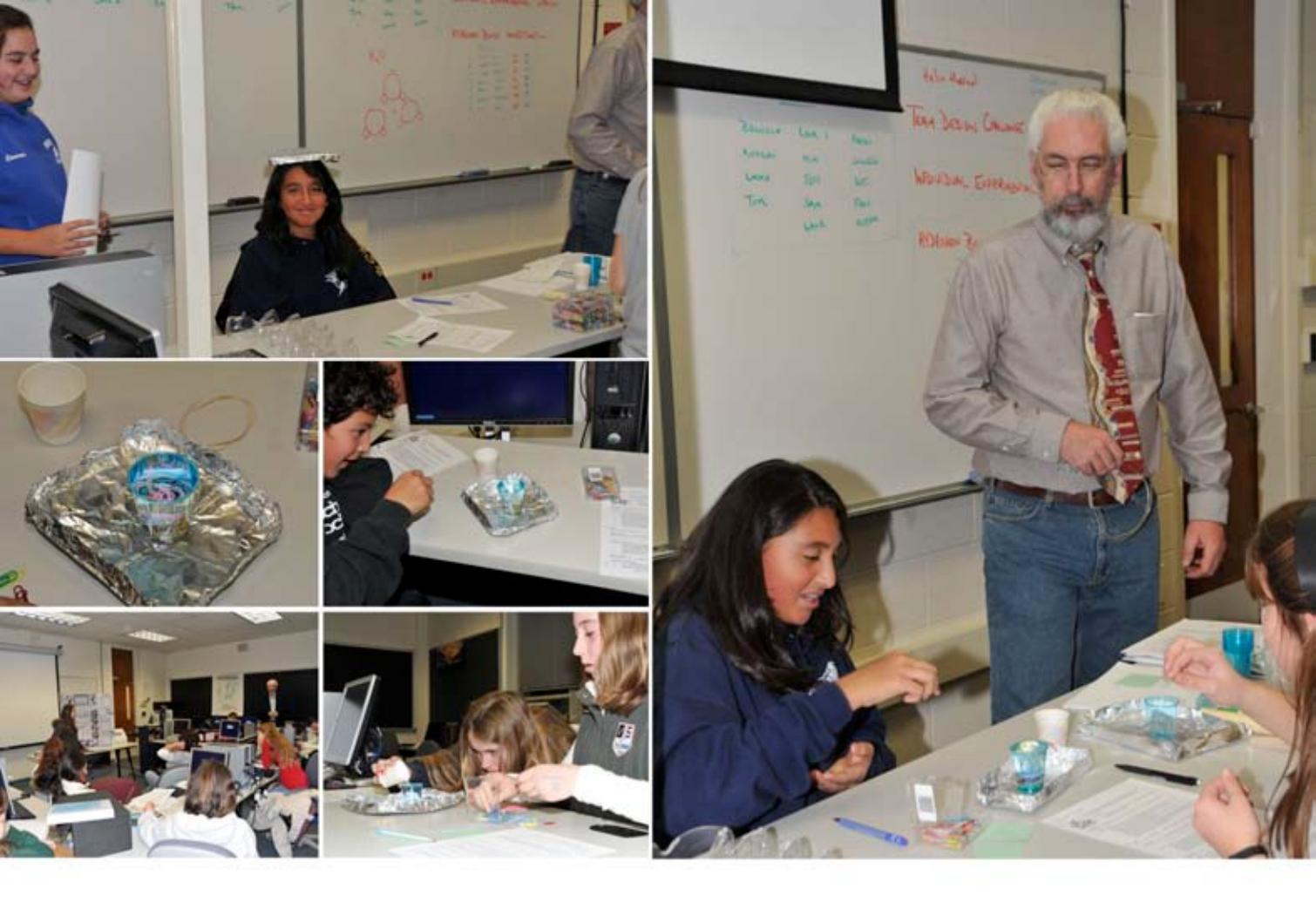
An amazing number of paper clips will fit into a full cup of water. Who knew?