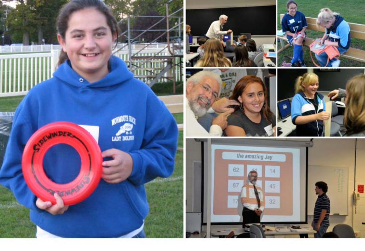
Does the expensive frisbee fly better than the cheaper one?