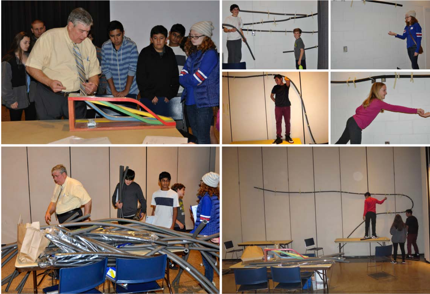
The class designs a slow descent marble roller coaster from foam tubes but first they predict which track will win the race. Which one do you pick?