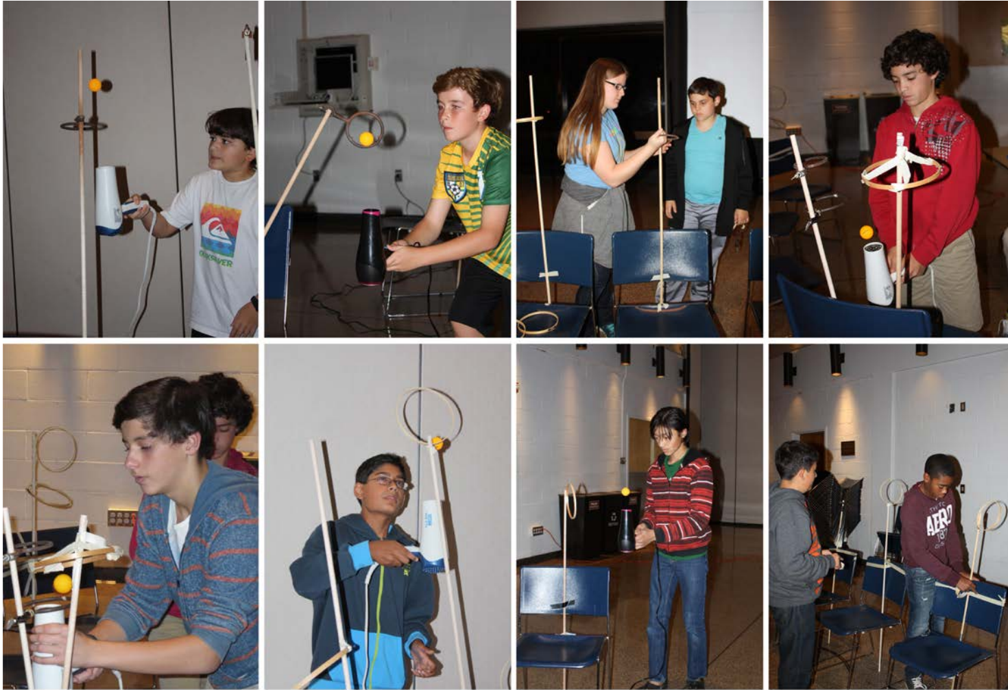
Continuing with Bernoulli's Principle, the class guided a Ping-Pong ball through hoops using the airflow from a hairdryer.