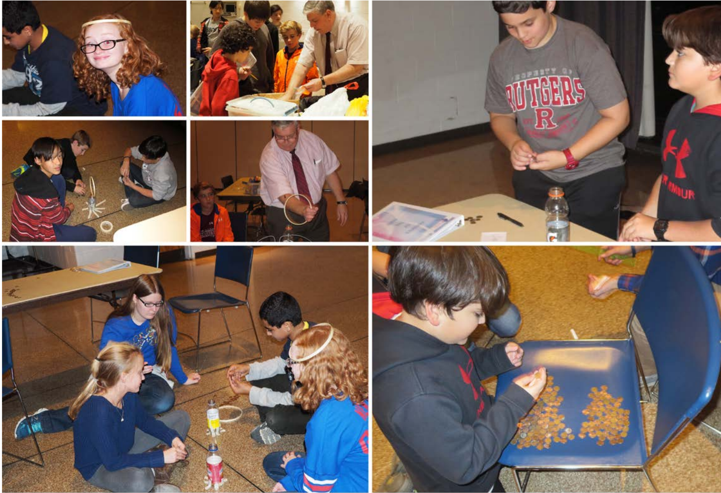
Investigating inertia, the class tries to get the most pennies balanced on a hoop to fall into a bottle.