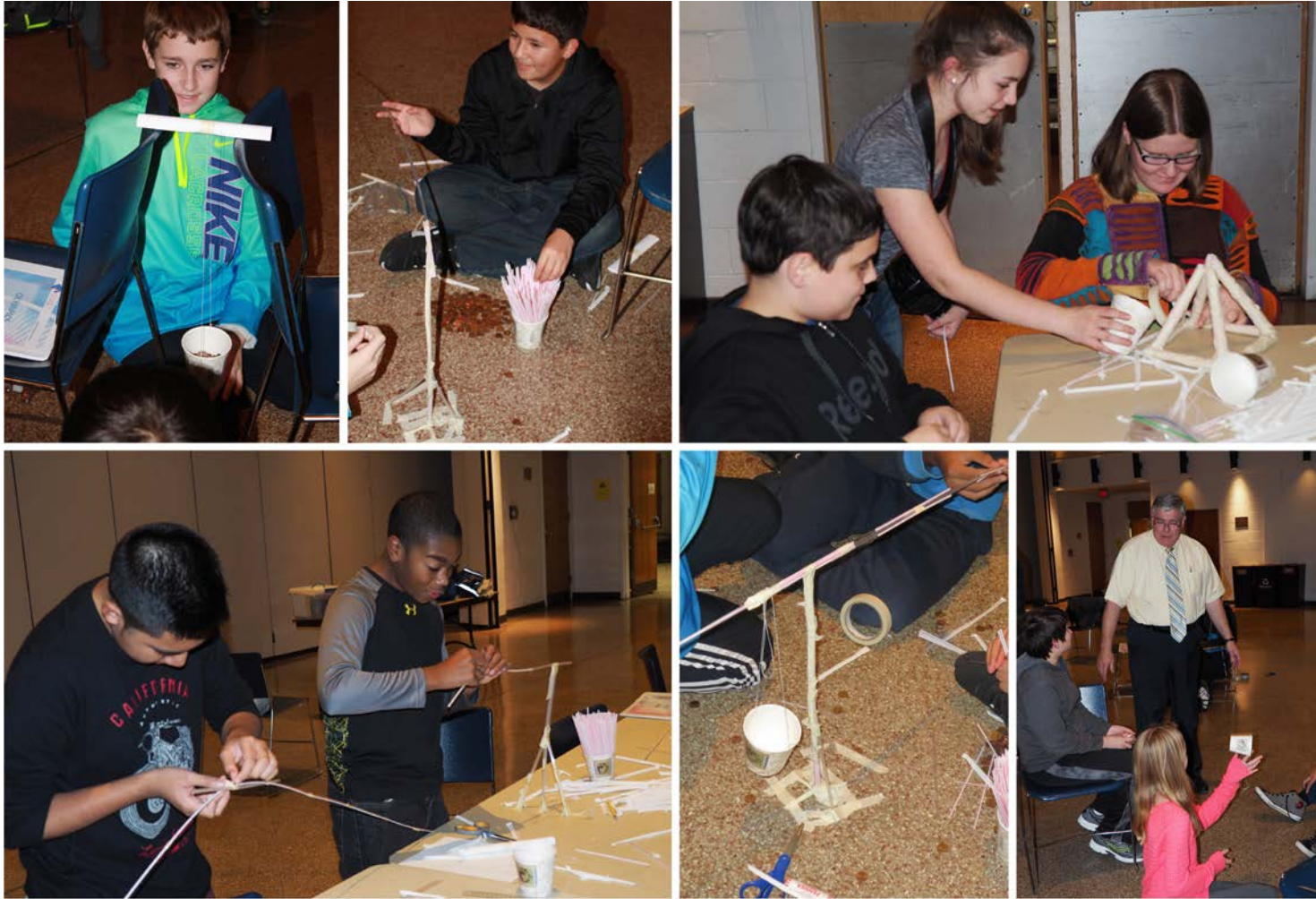
In this investigation, the class designs the longest cantilever structure constructed from tape and straws.