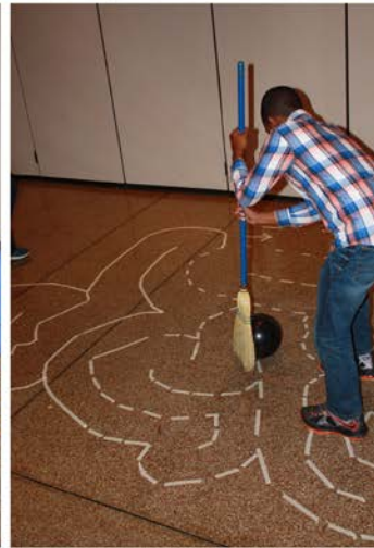
The class continues their study of inertia by guiding a bowling ball along a course in the fastest time.