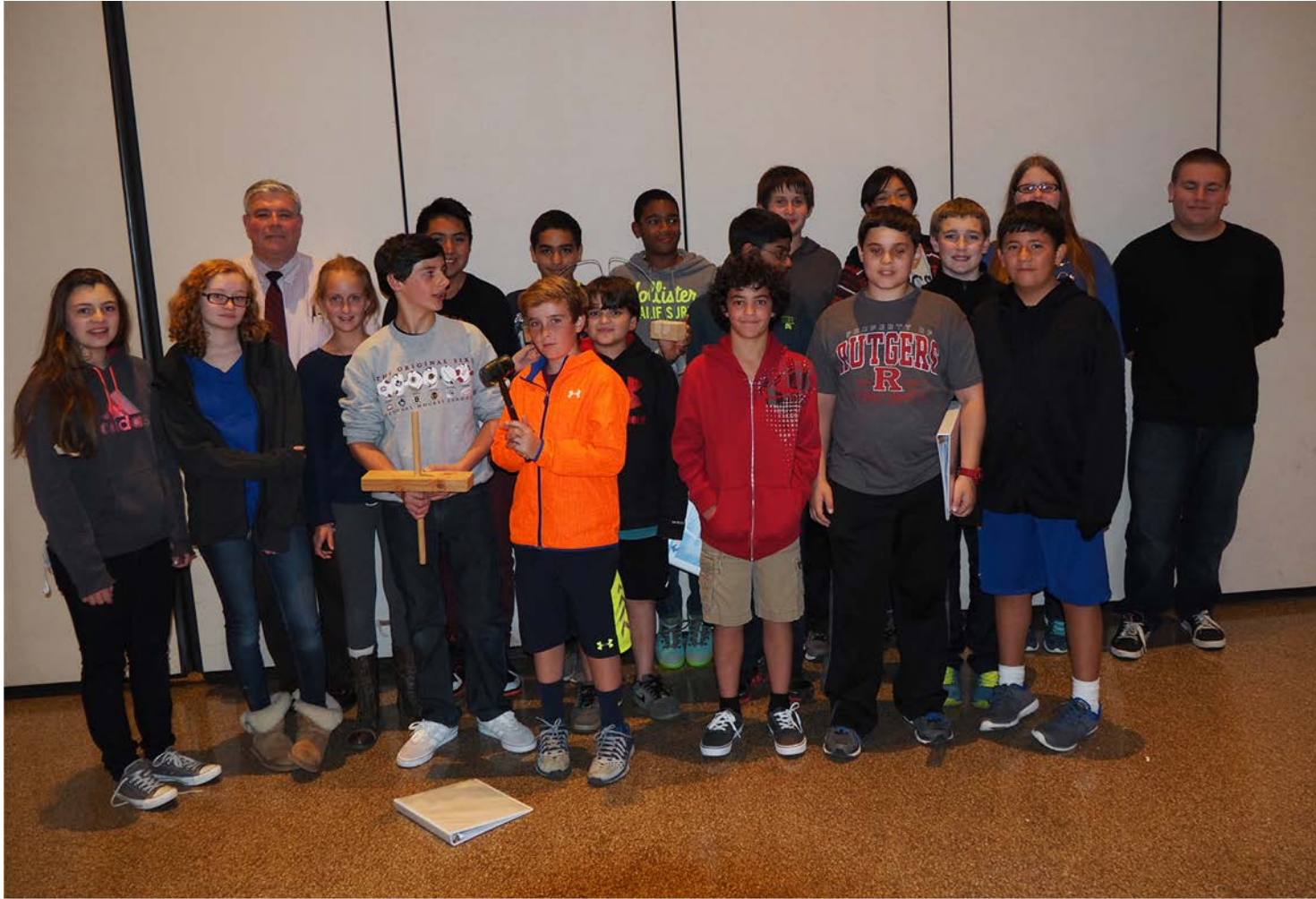
The class shows off their understanding of inertia by determining if the dowel or the block moves when the mallet strikes the dowel.