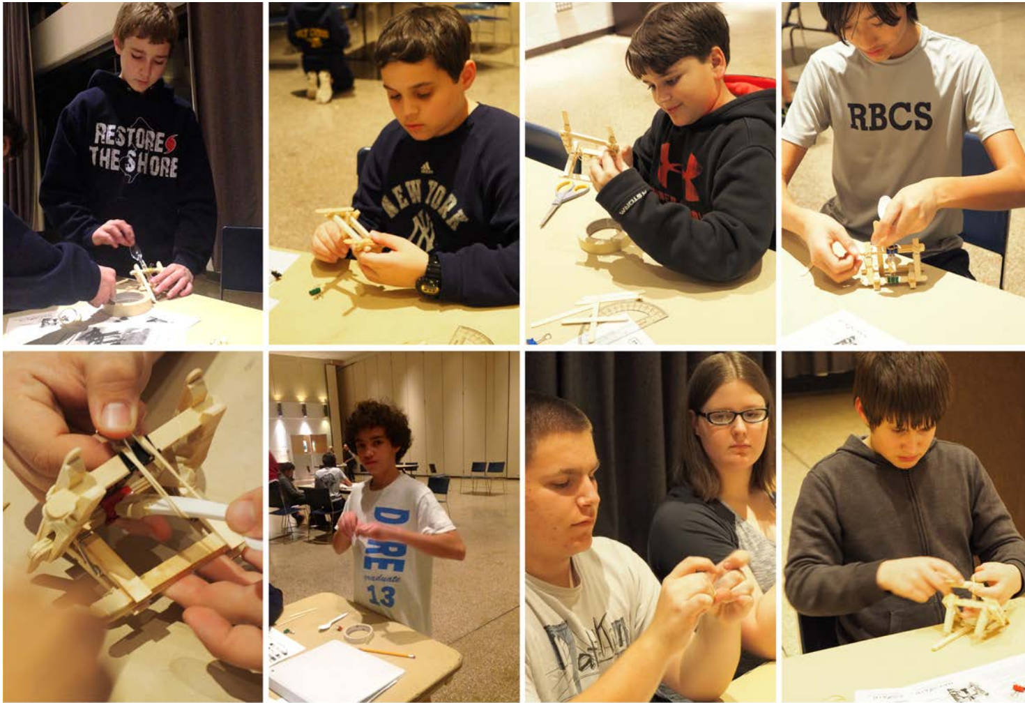
The students investigate the angle of greatest range at which to launch a marshmallow.