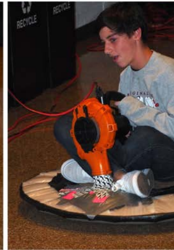
The students take a ride on a “human hockey puck”!