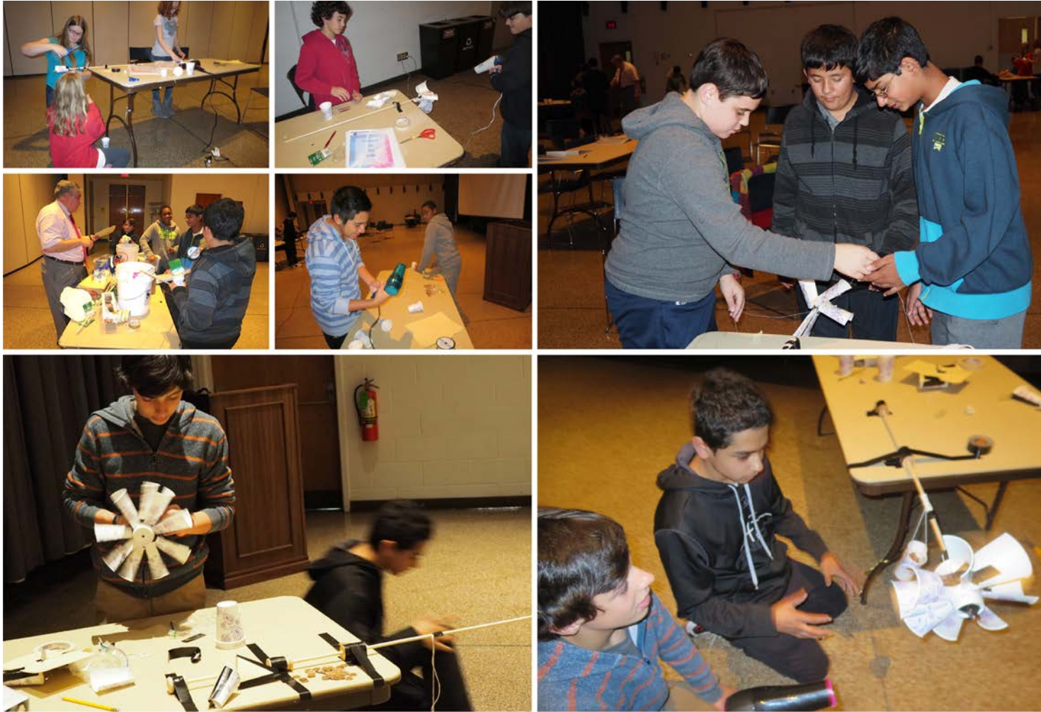
The students combine their understanding of Bernoulli's principle and structures by designing a wind power lifter to lift the greatest amount of pennies.