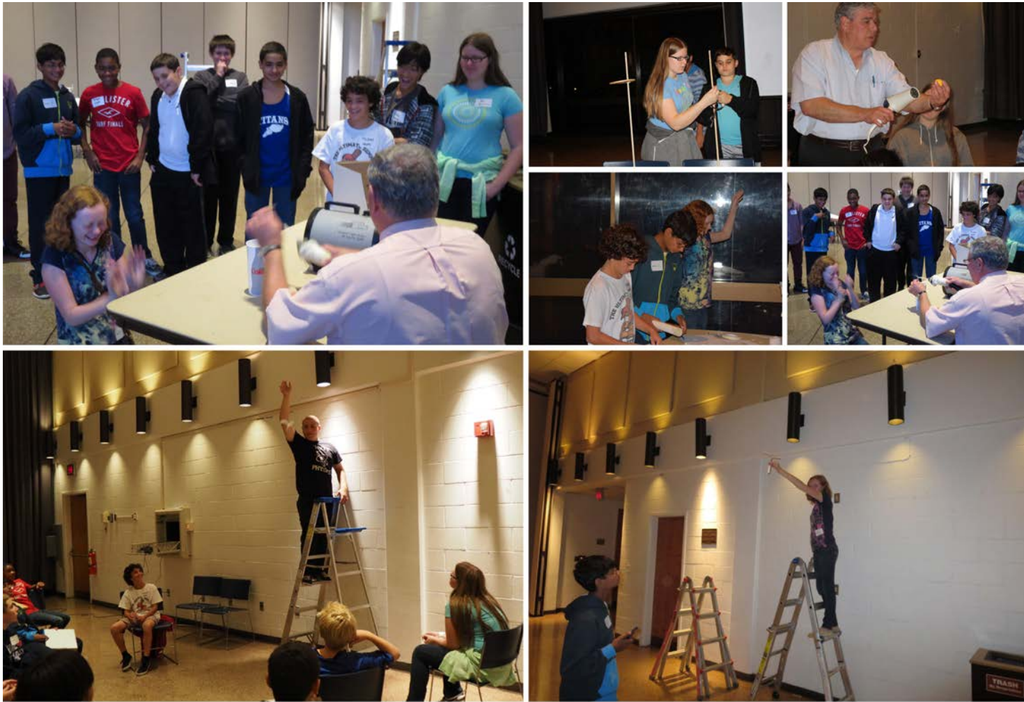
We investigated Bernoulli's Principle by designing a slow descent helicopter.