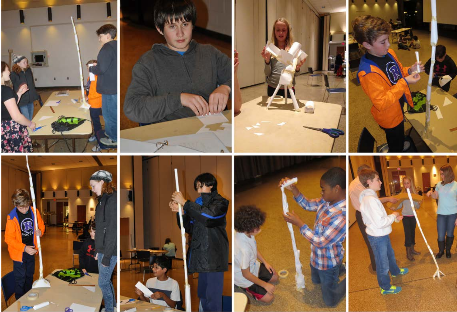
Continuing with structural design, the students design the tallest paper tower.