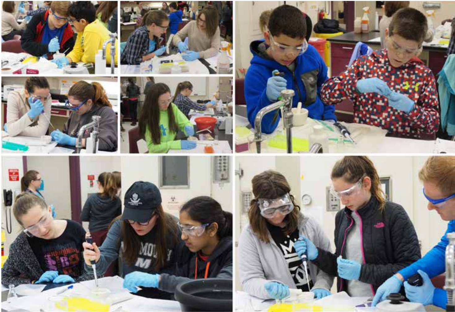
For our capstone experience, we tested food products to see if they contained genetically modified ingredients.