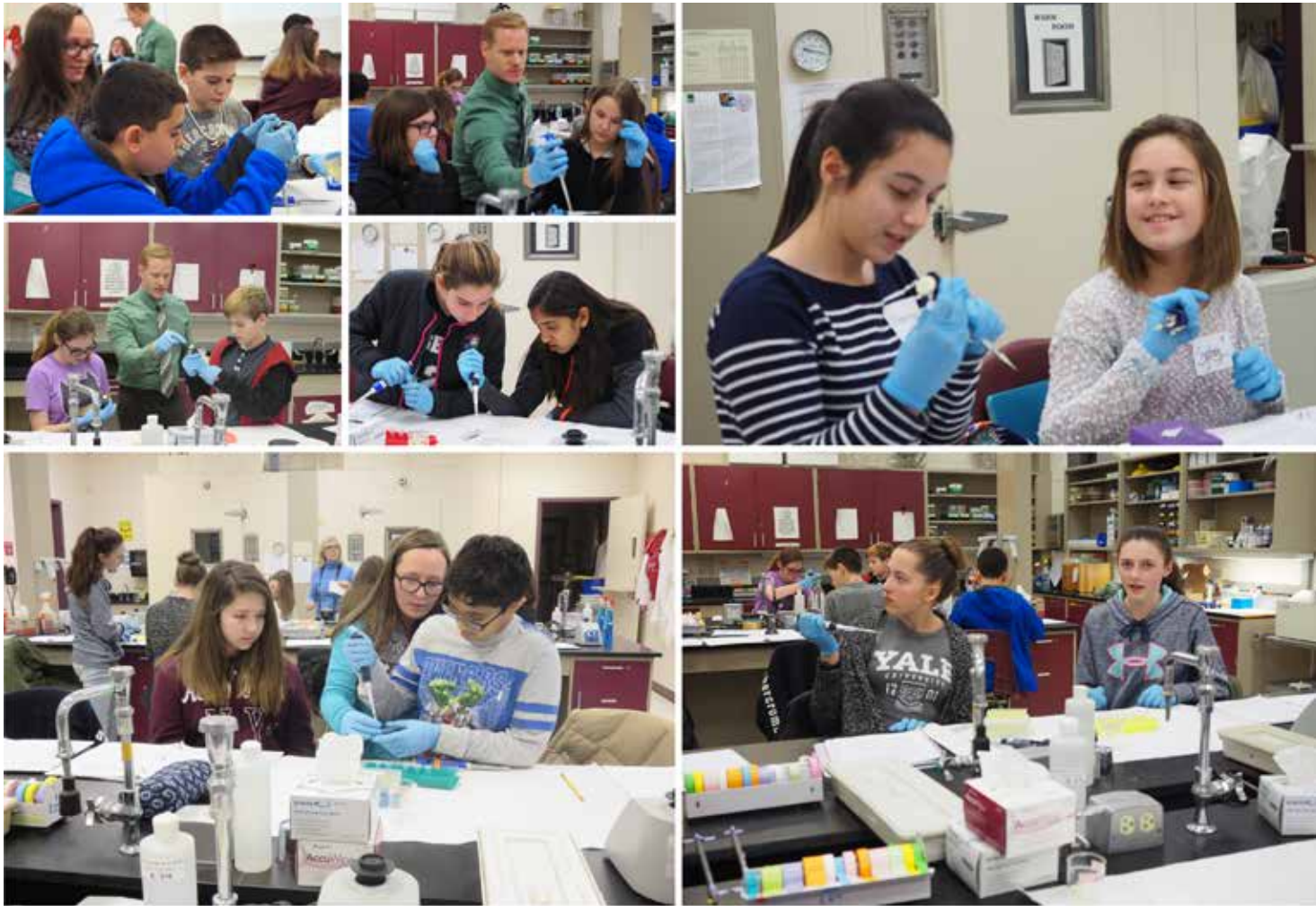
Our exploration of biotechnology began with identifying lab equipment that we would be using throughout the course, focusing on the proper use of the micropipette.