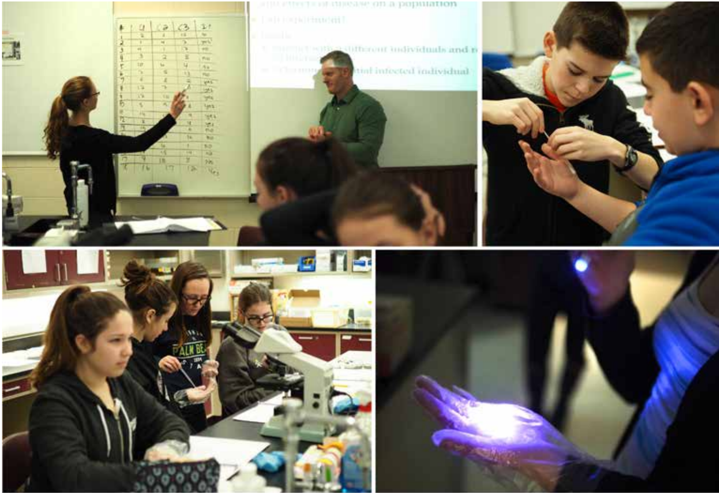
After discussing microbes, we learned about epidemiology and the spread of disease. That activity led us to experiment on two different hand cleaning methods.