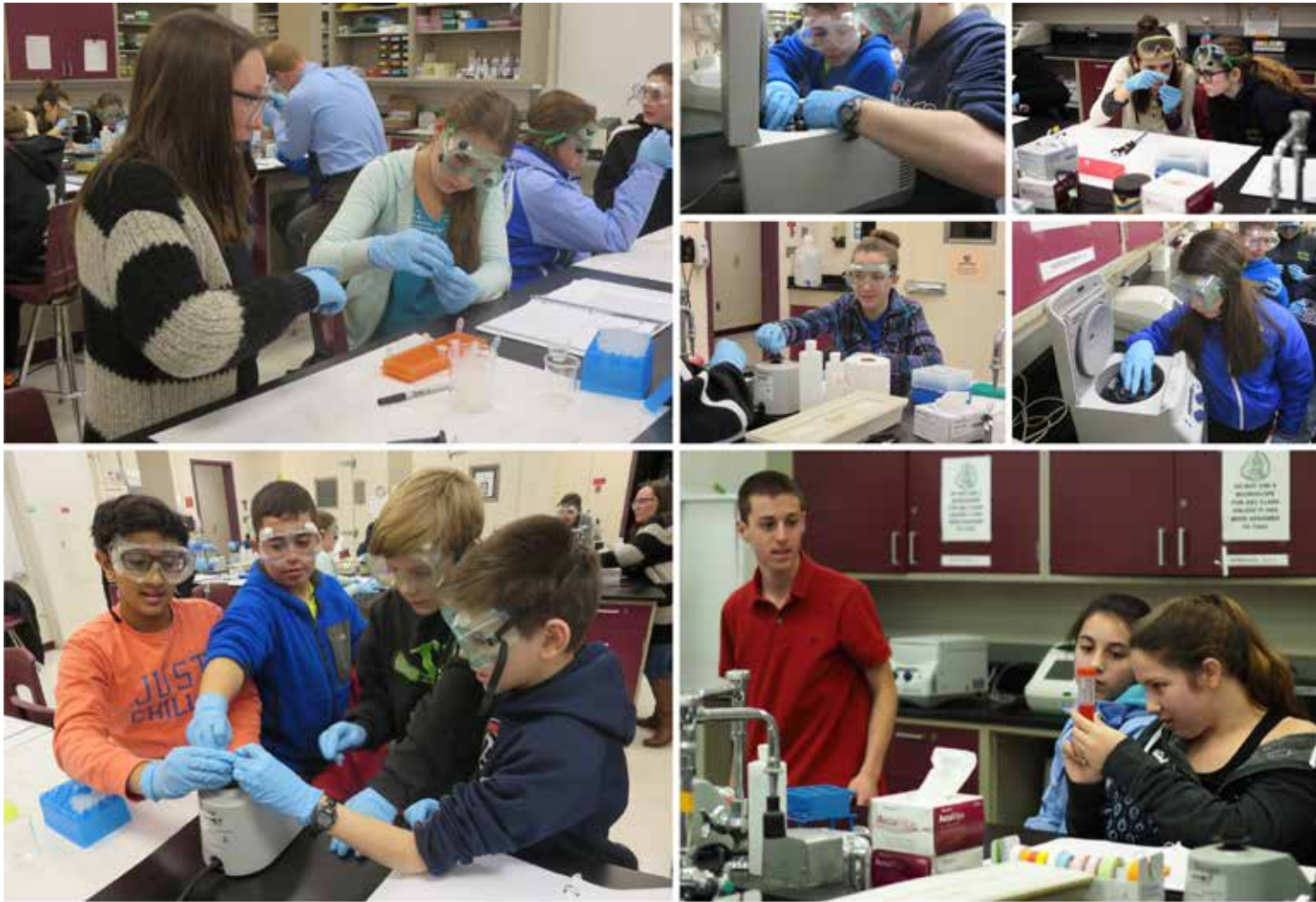
With some time and patience, many extracted DNA! We also had a few students become fascinated with the vortex and the microcentrifuge along the way.