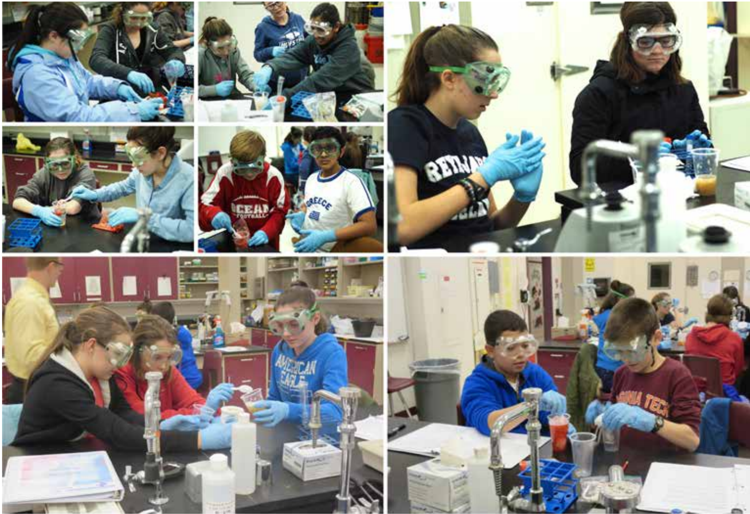
Learning about DNA was fun as we made candy models of the double helix. But it was more exciting to extract DNA from bananas and strawberries.