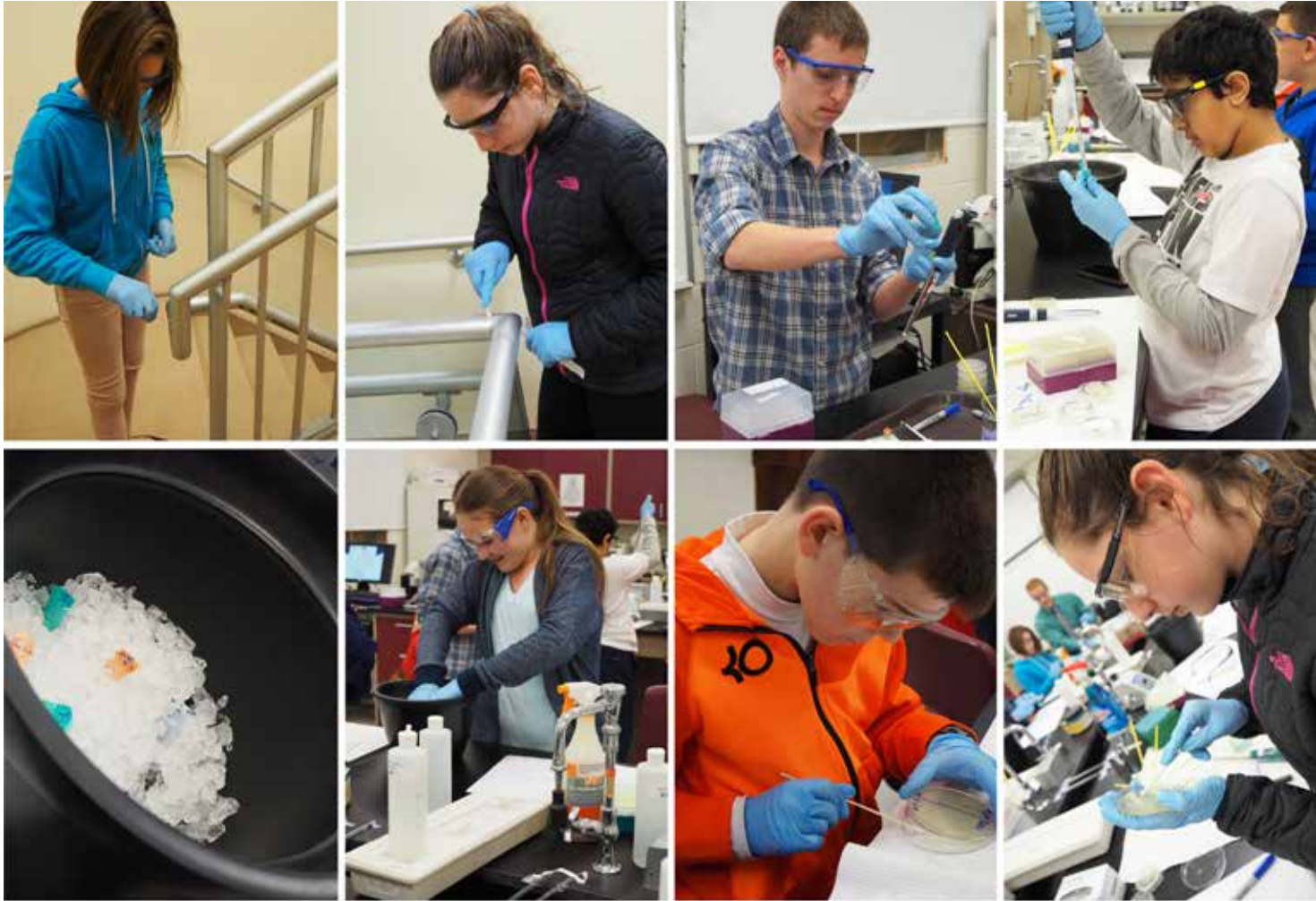
The next stop on our voyage taught us how to work with bacteria! In our transformation experiment, we attempted to genetically engineer bacteria. We also swabbed random places to measure bacterial growth.