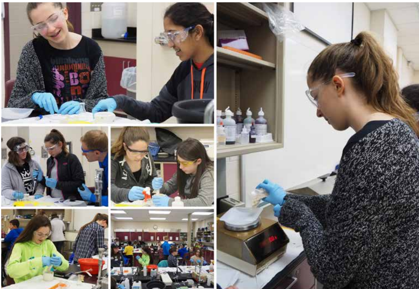
This experiment made use of most of the lab equipment and techniques that we explored throughout the course!