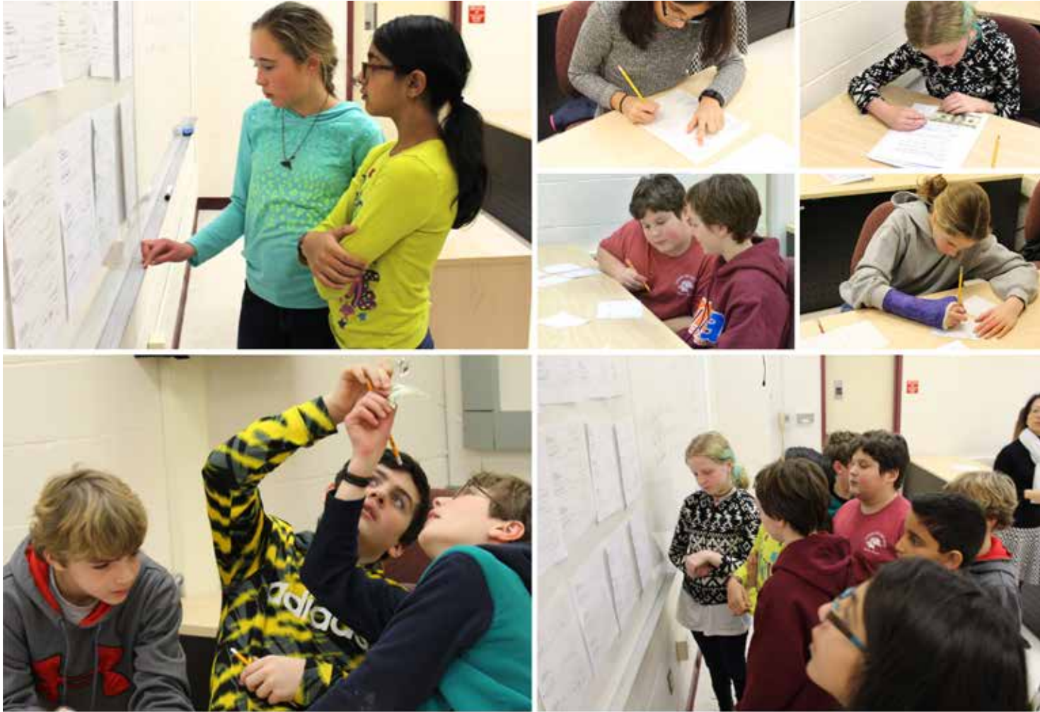
After learning about twelve basic characteristics in handwriting comparison, we were able to identify unique characteristics found in a ransom note.