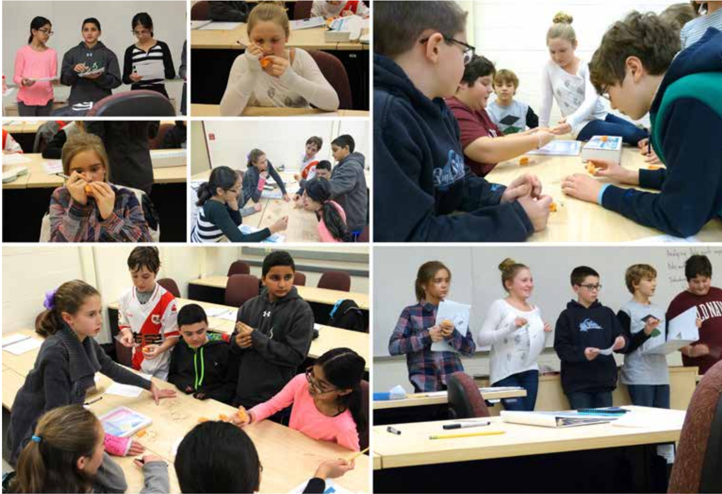
A partial bite mark impression helped us solve "Sissy's Kidnapping" case.