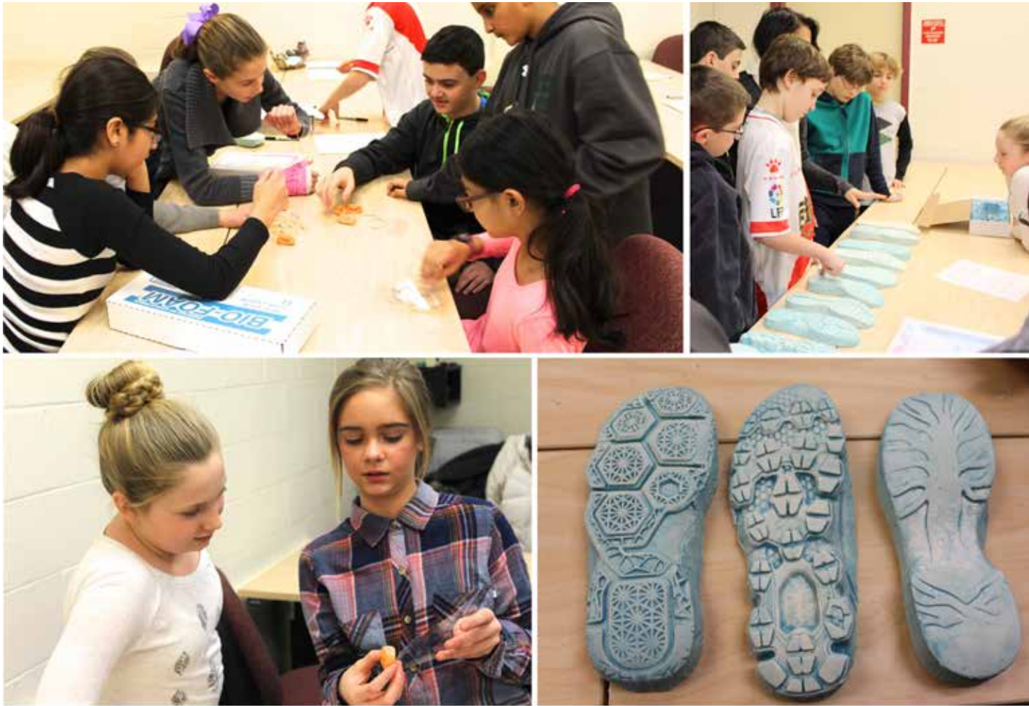
Some of our shoe impressions were quite impressive.