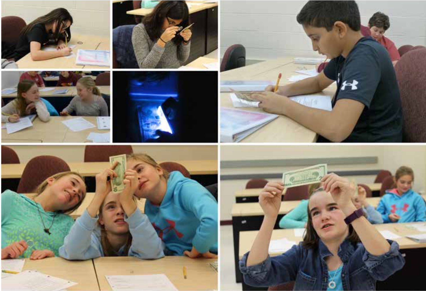
We examined security features in our currency.