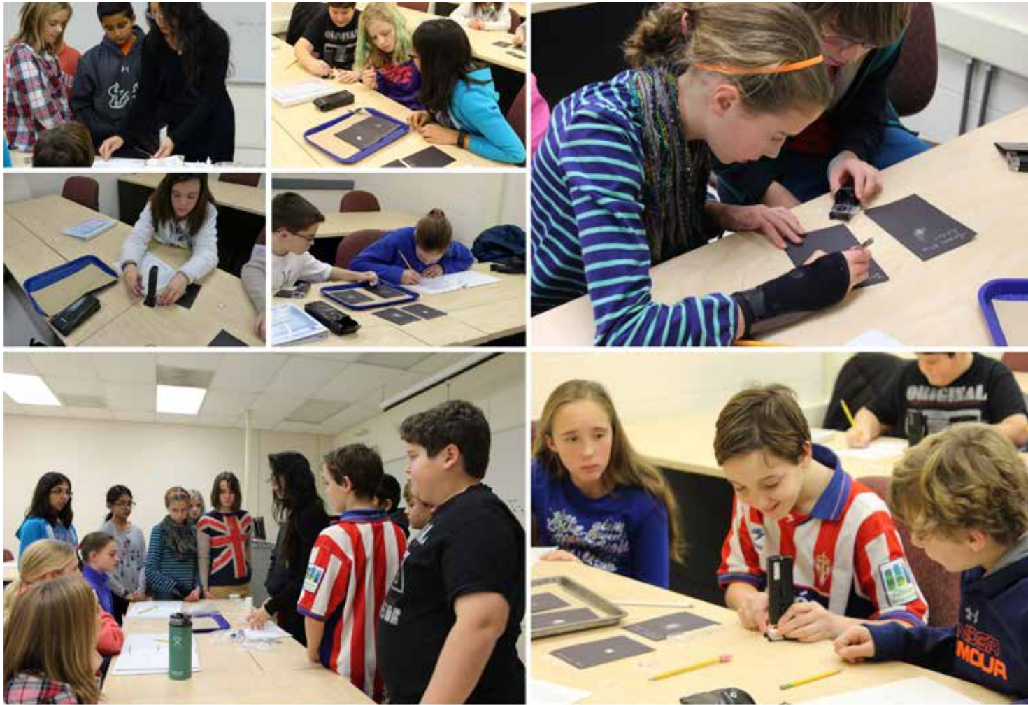
To determine whether Dr. X was poisoned, we used microscopes to analyze crystals from the sugar bowl.