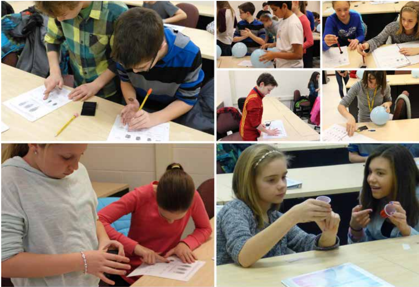
Each team worked hard at reconstructing the crime that took place at Plum Computer Company.