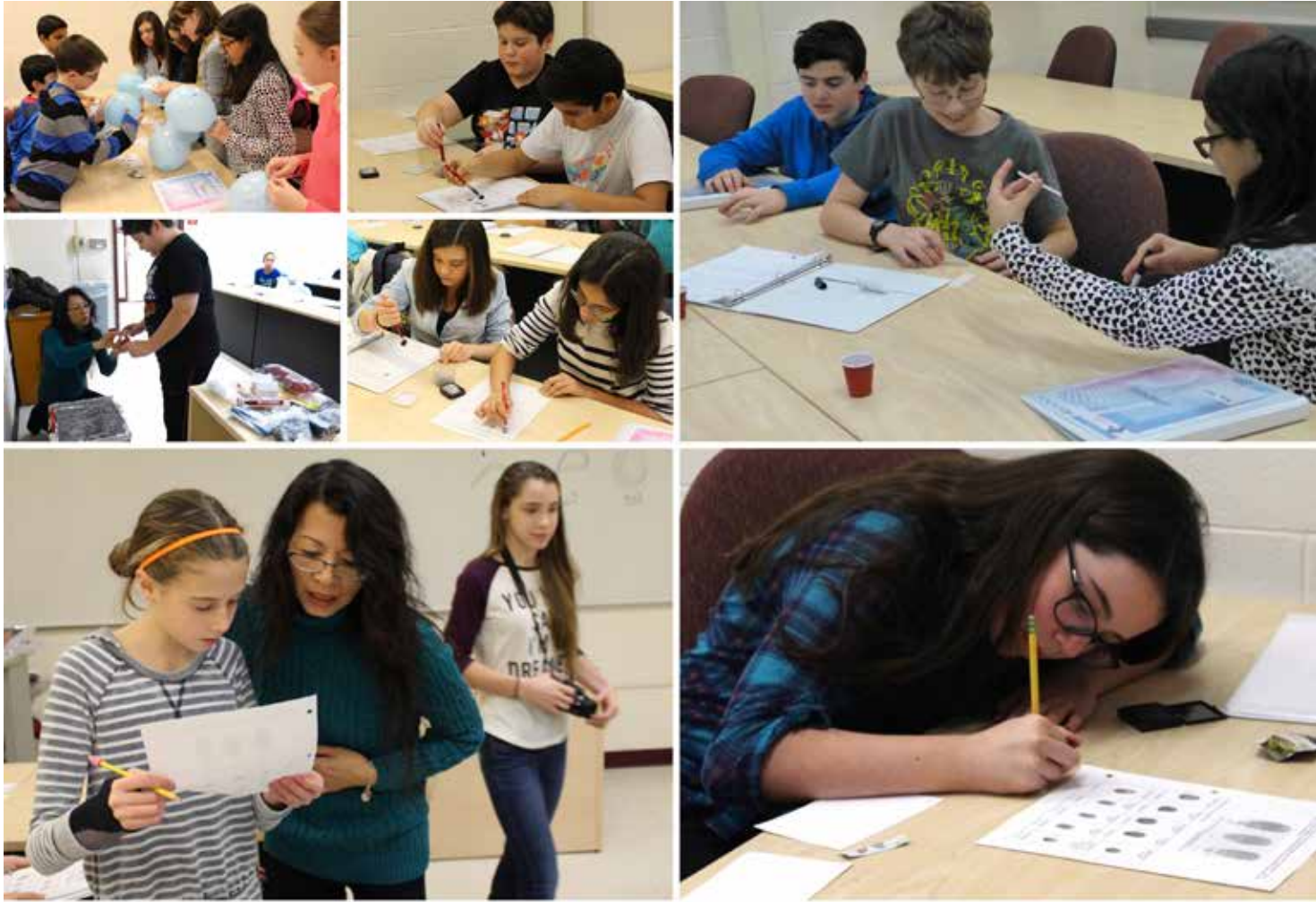
Latent prints were easily revealed after we dusted with magnetic powder.