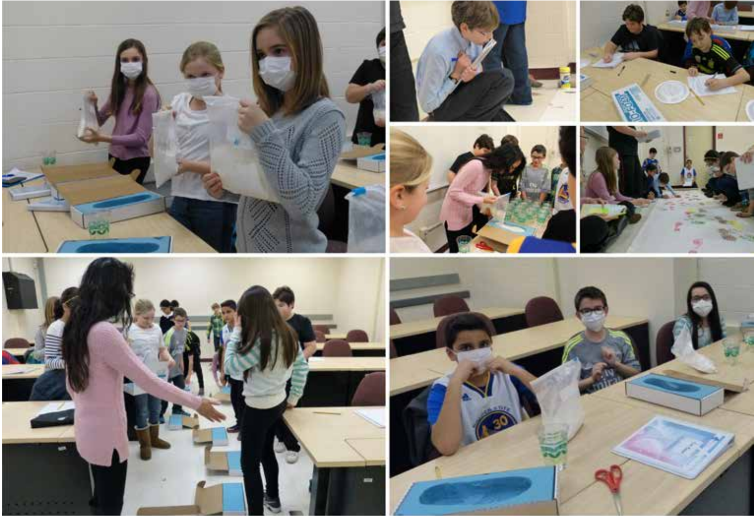
We learned how to create a cast of our own shoe impression.