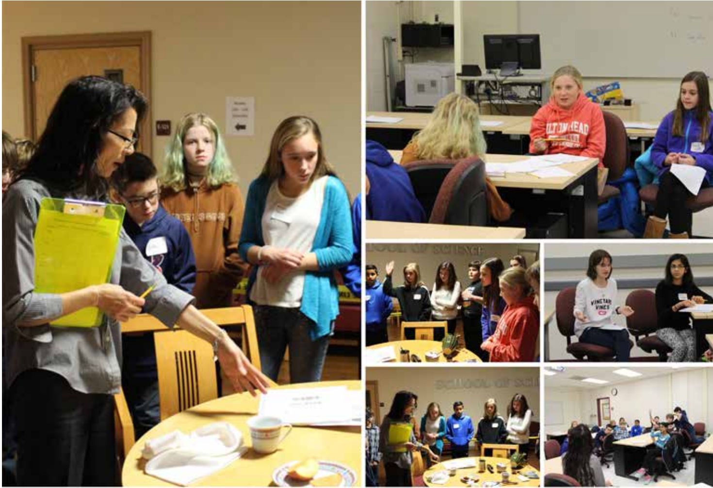
At the crime scene, we looked for possible evidence to help us solve the case.