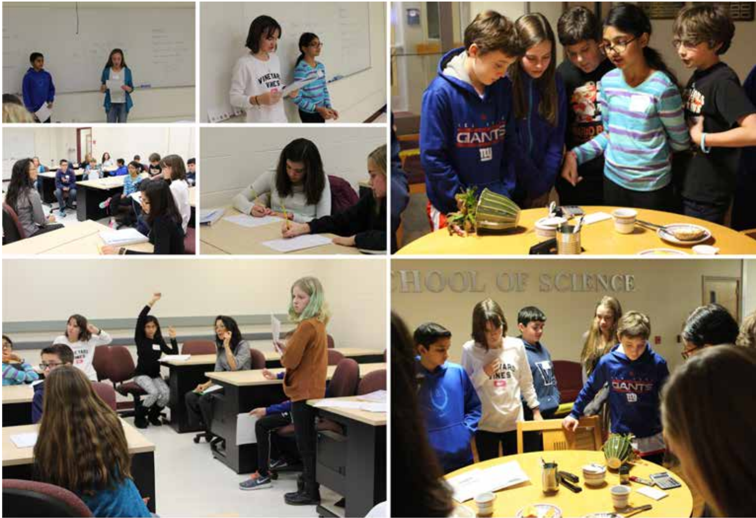
We opened our forensics course with our first case, "What Happened to Dr. X?"